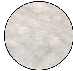
100% synthetic fibers and yarns