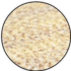
Endless woven base fabric